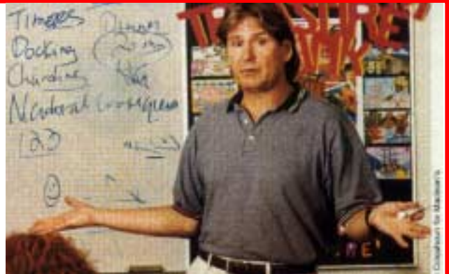
Taylor in Calgary: 'look at your sex life—it won't lie to you'

Mutual neglect can do much more than lead to bad sex—it can torpedo a marriage if it spawns infidelity. Guldner, who specializes in counselling couples grappling with the fallout from cheating, says that except for chronic philanderers, affairs are rarely about sex. Usually, the cheater is avoiding another issue: they are turned off by a partner's weight gain, for instance, or they are too often left alone by a spouse obsessed with work. "Many, many people say that sex in the affair isn't nearly as good as it was with their partner," Guldner says. But if couples are willing to confront one another with their problems, they often survive an event that, in the past, was widely viewed as unforgivable. That is partly because cultural shifts have weakened old notions of sexual possessiveness. "There is less exclusivity to the sexual act now because so