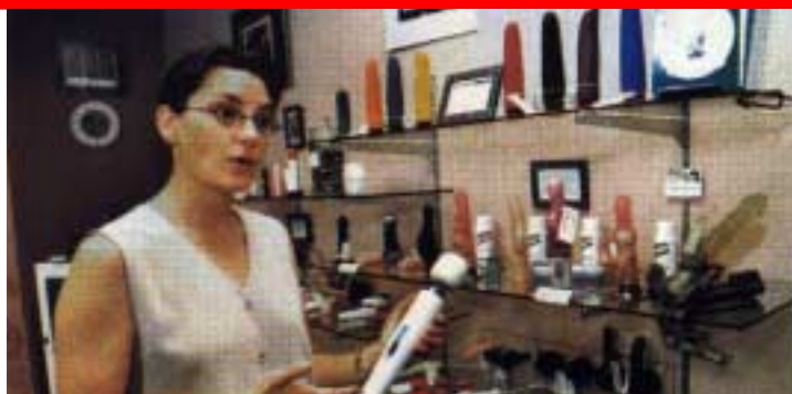
Browsing at Womyns' Ware: shelves free of hard-core videos

In fact, there is something of a revolution under way in the area of sex aids, especially for women. Shops like Womyns' Ware in Vancouver and Good For Her in Toronto coax women inside with tasteful decor and shelves free of hard-core videos and magazines, or cheap, crudely made products.